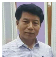
By: N. Munal Meitei

Everyone has a role to play in effectively implementing the global shift to a decarbonized economy. The world is looking at the climate actions by the governments during this COP-27. Research shows that meat and dairy products are fueling the climate crisis, while plant-based diets - focused on fruits, vegetables, grains, and beans - help protect the planet.